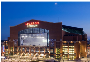
Lucas Oil Stadium & Indiana Convention Centre Venue for GC 2020

25 June to 4 July 2020 is when the 61th General Conference Session will be taking place in Indianapolis, Indiana, USA. The theme for the session is "Jesus is Coming! Get Involved!" Tens of thousands of people from all over the world